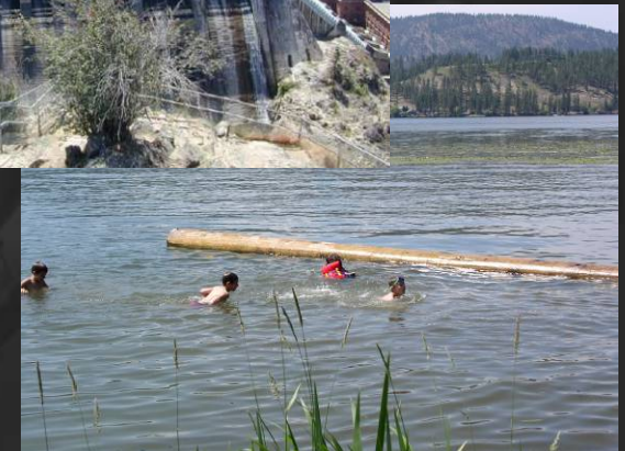
Long Lake Reservoir, Spokane River